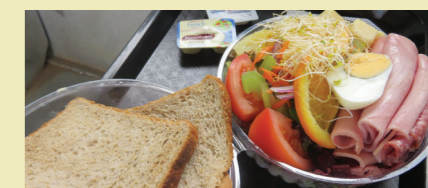
1 day tour & 2.5 hour cruise lunch